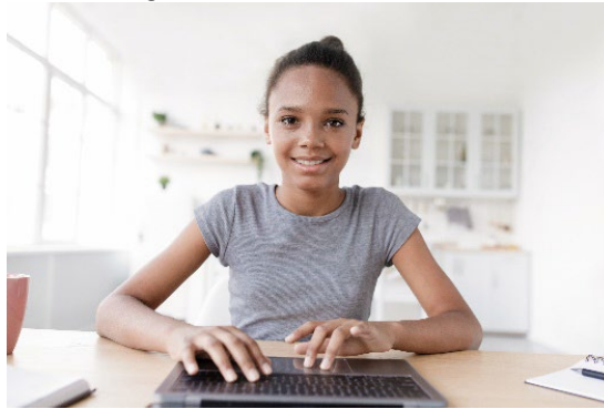
Figure 1 Facial Webcam View